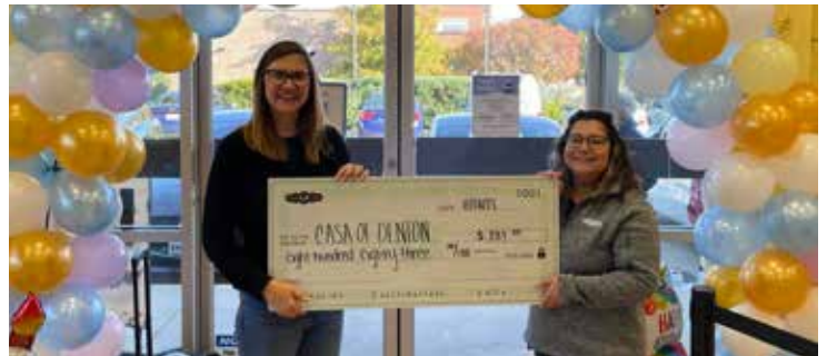
▲ Nothing Bundt Cakes of Denton donated 10% of their sales to us as the beneficiary of their birthday celebration.