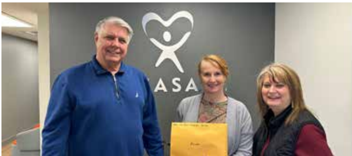
▲ Heart Hospital of Denton collected over $2,000 in gift cards for holiday gifts for CASA kids through their employee gift card drive.