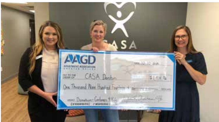
< Apartment Association of Greater Dallas donated $1,914 for Halloween costume gift cards through their annual Costumes4Kids fundraiser.