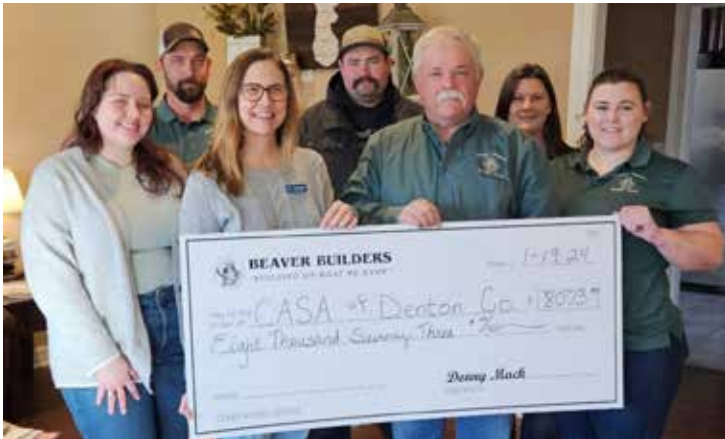
▲ Beaver Builders Playhouse Raffle raised over $8,000 for us with their Playhouse Raffle.

Thank you to our amazing local community businesses for supporting the mission of CASA of Denton County!