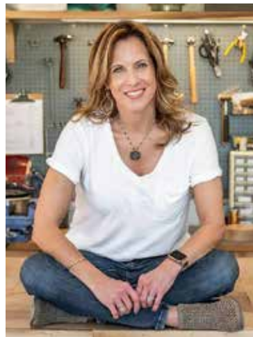
< LJ Artisan Designs donated 10% of their December sales to us.