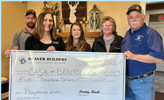
Beaver Builders held their annual playhouse raffle benefiting CASA of Denton County.

We would also like to thank the following community partners (not pictured) who helped us carry out our mission: Aromas on Oak, Bahama Bucks of Roanoke, Blue Moon Artistry, Cross Timbers Rotary, Infinite Electronics, Krum Lions Club, PEO Chapter IZ, Pilot Knob Rotary, Robson Ranch Women's Club, Scentsy, Team Izzy Foundation.