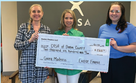
Exeter Finance nominated us for their competitive Giving Madness campaign.