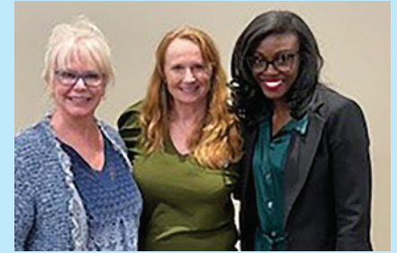
Fidelity Charitable designated us as a recipient of their Make More of a Difference award.