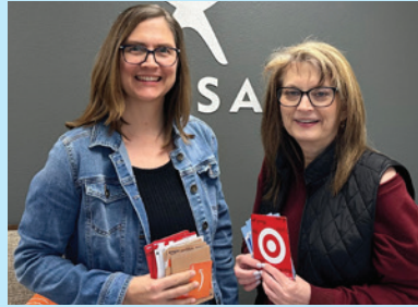
The Heart Hospital of Denton presented us with their annual holiday Care4Kids donations.