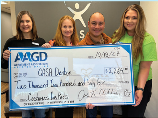
Apartment Association of Greater Dallas raised funds to provide Halloween costumes for the children we serve.